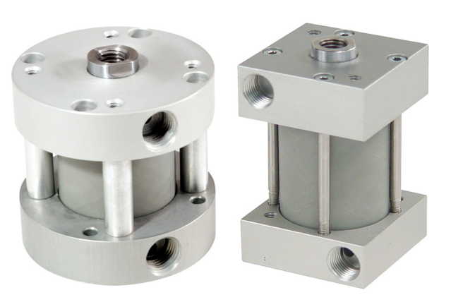
In addition to a bored body design, Pancake® cylinders are available with round and square designs (left and right) in a conventional tie-rod/spacer configuration.

In addition to specifying the right configuration, it's important to make sure your compact air cylinder meets the proper size requirements. Due to their use in tight or limited spaces, look for standard bore sizes between 0.5 and 4 inches, as well as standard strokes up to 4 inches.